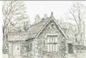
RUSLAND READING ROOM