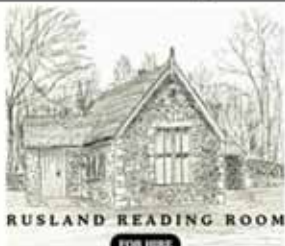
RUSLAND READING ROOM